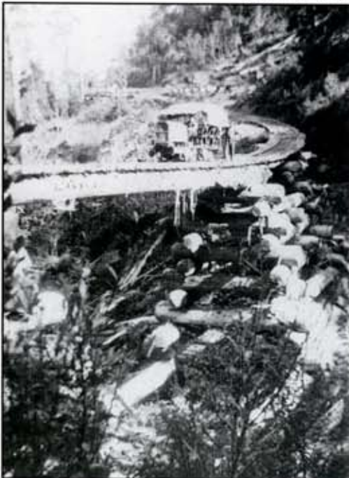
Chock Log Bridge