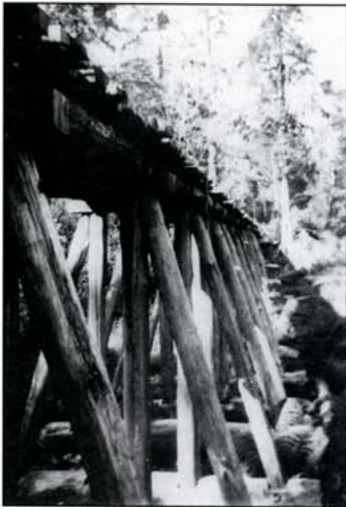
Leg Log Bridge